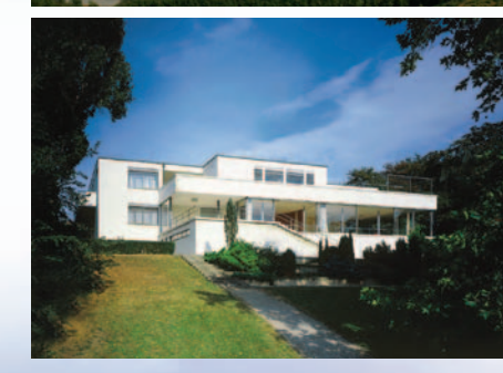
International Airport Brno; Brno Circuit; Villa Tugendhat